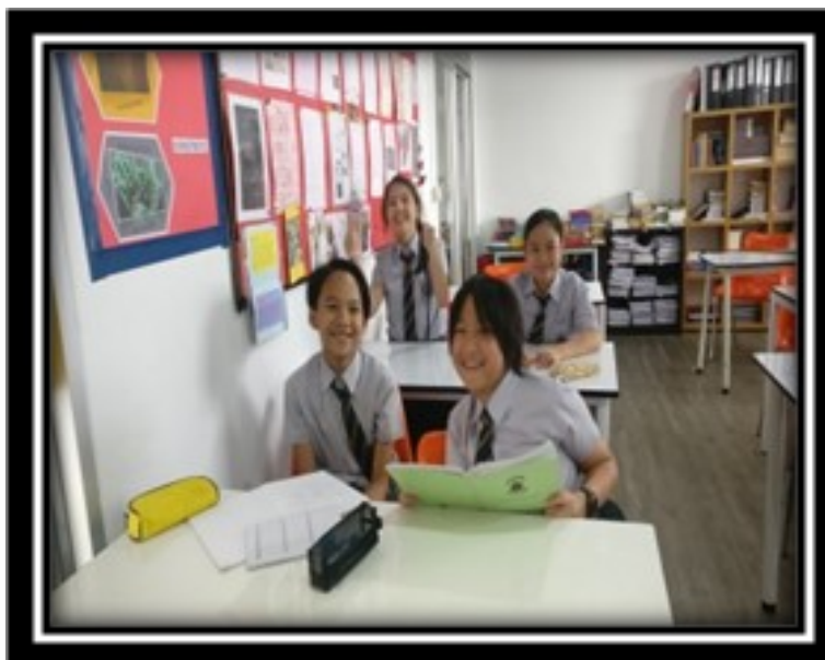
Year 8 pupils composing their narrative in English class.

Year 8 are studying "Narrative Writing", they will write using metaphors, adjectives, similes, sentence variety, imagery, vocabulary, effective verbs and powerful adverbs. They will use the 5 point plan to build a story – gripping opening, back –story, problem and complication, crisis and resolution. I look forward to reading their completed story at the end of Term 3a.